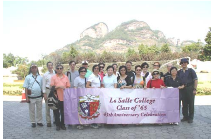
Wu Yi Shan Tour