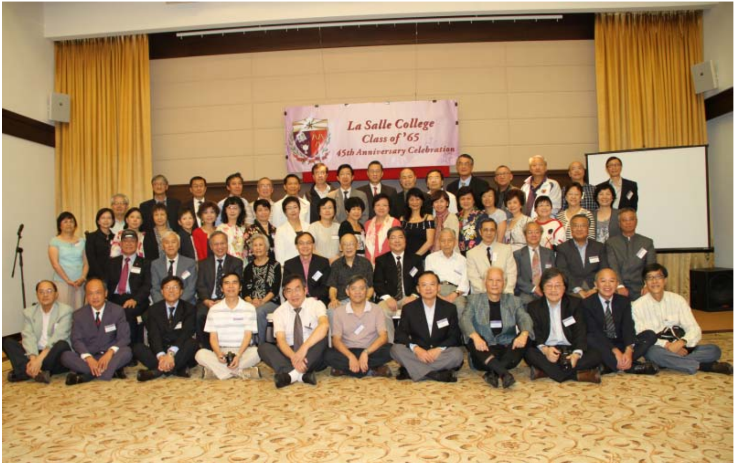
Reunion Dinner - Hong Kong

(From left to right, boys and teachers only)