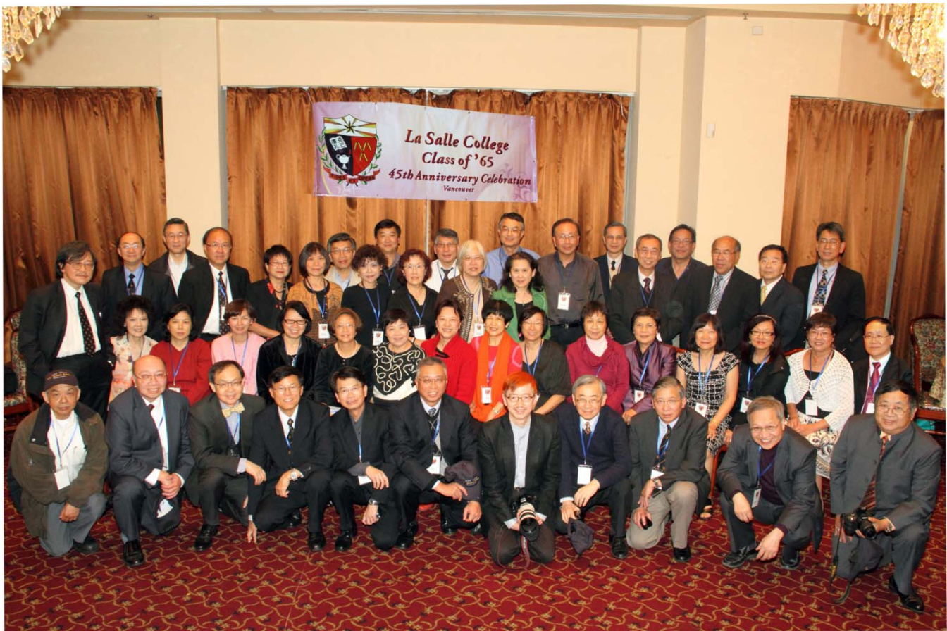
Reunion Dinner - Vancouver

At the end of the reunion, everybody was asking about the date of the next get-together. It seems a long time to wait for the Golden Jubilee in 2015!